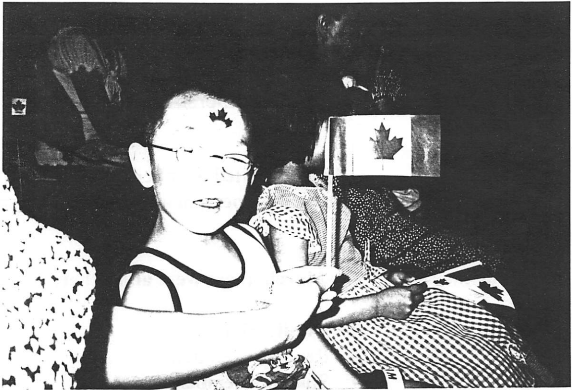
Canada Day Celebration