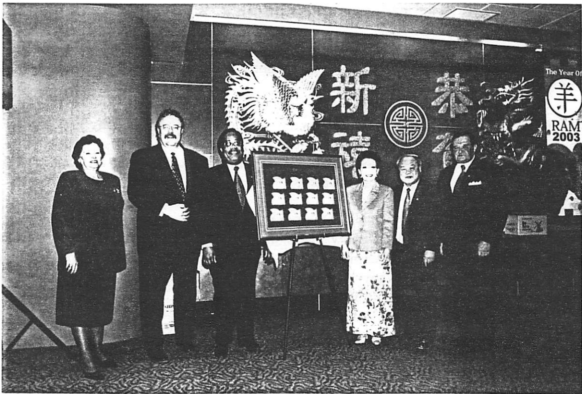
Stamps of the Year of Sheep Presented by the Government to the Centre