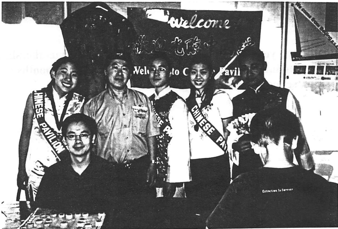
Forklorama -- Chinese Pavilion