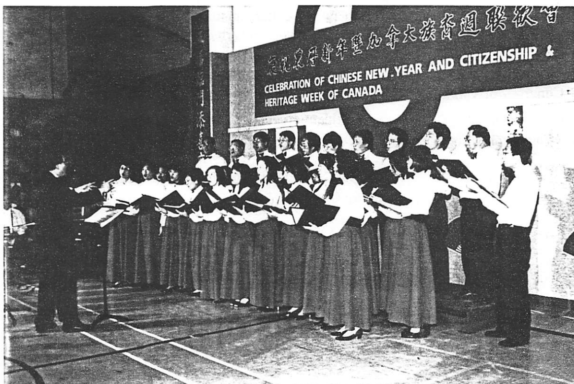
Celebration of Chinese New Year and Citizenship and Heritage Week of Canada