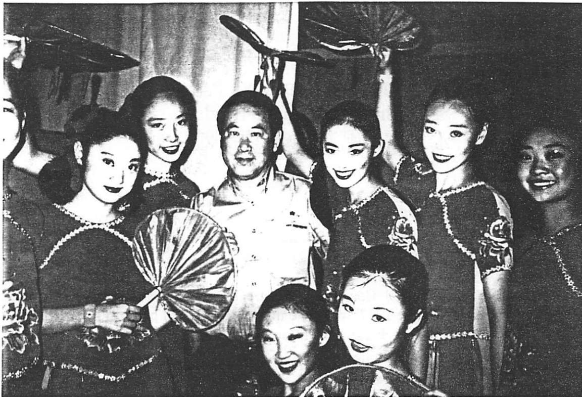
Folklorama – Youth Performing Troupe from China