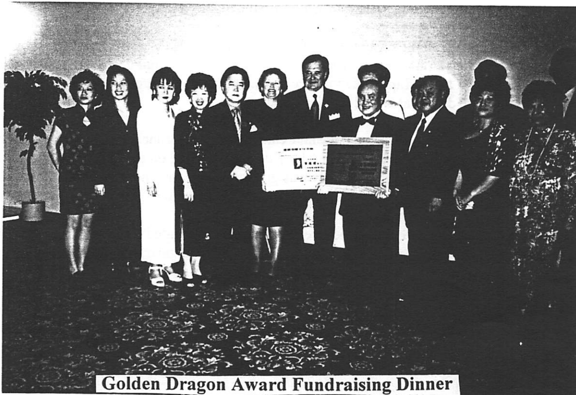
Golden Dragon Award Fundraising Dinner