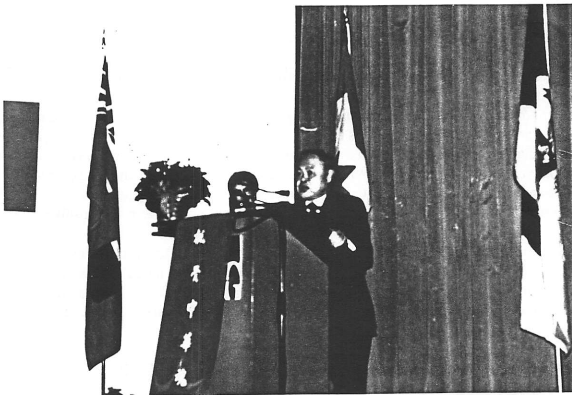
The Winnipeg Premiere of Two Documentary Films <Canadian Steel, Chinese Grit> & <Monument To The Nameless Heroes>