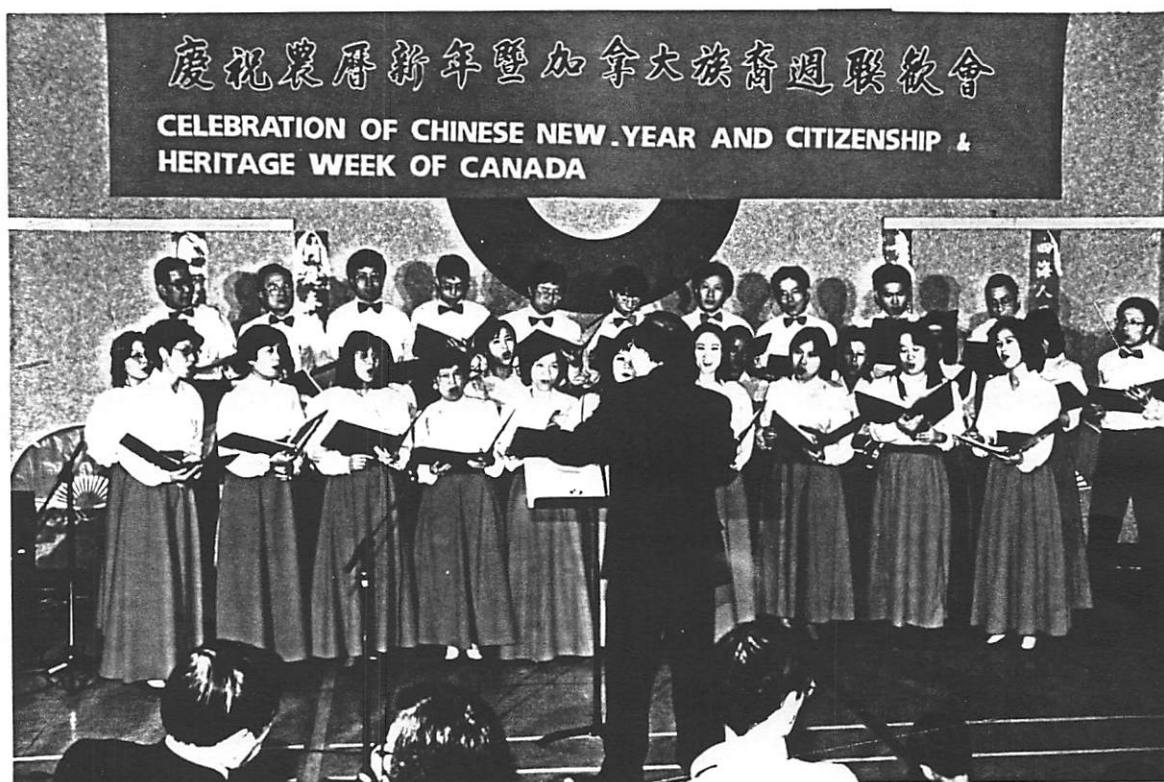
Celebration of the Chinese New Year And Citizenship & Heritage Week of Canada